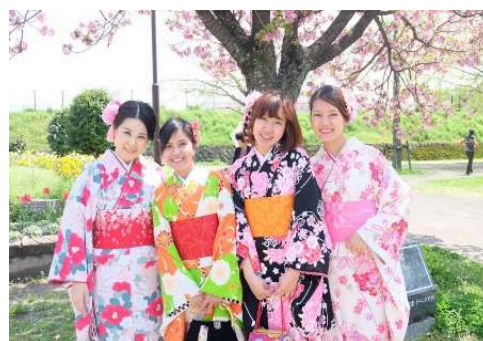
Lao students in Kimono with cherry blossom

The current enrollment of the students is 1,644 of which 963 are undergraduate and 681 graduate students (as of May, 2022). Nearly 250 international students, mostly graduate students, have come to study from various countries. Currently, the total number of the faculty members and staff members is 265 of which the number of full-time academic researchers is 173 including 55 full-professors, 64 associate professors, 54 assistant professors. In addition, a number of institutes in Kyushu University, but independent from the Faculty of Agriculture, have also merged with the Graduate School of Bioresource and Bioenvironmental Sciences; namely, the Biotron Institute, the Institute of Tropical Agriculture (in part), and the Bio-Architecture Center.