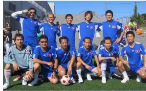
Lao Team at KUFSA soccer tournament

More than 40 students from Laos have been chosen through highly competitive selection procedures and enrolled in our MA degree since 2006. In this Program, some scientific tours for the JDS Fellows have been offered from time to time during the two year Master course period for each fellow. The aims of these tours are to promote a greater understanding of policies, circumstances, and technologies in Japanese agriculture. Our program has proven successful and has been acknowledged by the academic and research institutions of our students' home countries. Research in the individual laboratories in our graduate school as well as opportunities of exploring fields and of presenting their research at international conferences enrich their experiences. Our educational excellence is also evidenced by the fact that our graduates are highly sought after by academic institutions and industries alike.