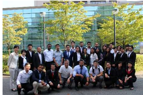
2017 JASID Western Japan Research Meeting, Kumamoto, Kyushu

Since 2017, IGP of Graduate School of Bioresource and Bioenvironmental Sciences, Kyushu University and International Development and Cooperation (IDEC), Hiroshima University with other development programs in western Japan have formed a partnership in hosting annual JASID Western Japan Research Meeting. This provides an opportunity for JICA scholars across disciplines to share ideas and grasp lesson learnt from their peers who are future leaders of their countries. It took place at Kumamoto University, Kyushu on August 29, 2017, held at Hiroshima University in 2018 and Kyushu University hosted the academic meeting in 2019.