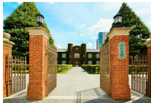
Main gate at Ikebukuro campus

3-34-1 Nishi-Ikebukuro, Toshima-ku, Tokyo 171-8501, Japan