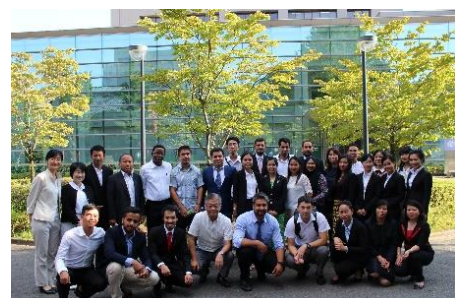
2017 JASID Western Japan Research Meeting, Kumamoto, Kyushu

Since 2017, IGP of Graduate School of Bioresource and Bioenvironmental Sciences, Kyushu University and International Development and Cooperation (IDEC), Hiroshima University with other development programs in western Japan have formed a