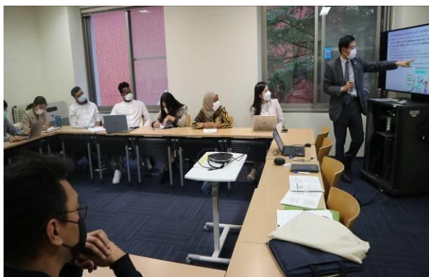
In the classroom

To promote our students to complete master's theses of high quality, we will provide students with opportunities to present their master's theses at international academic conferences, either in the last semester of the second year or after graduation. We also support the publication of the master's thesis if it is of publishable quality.