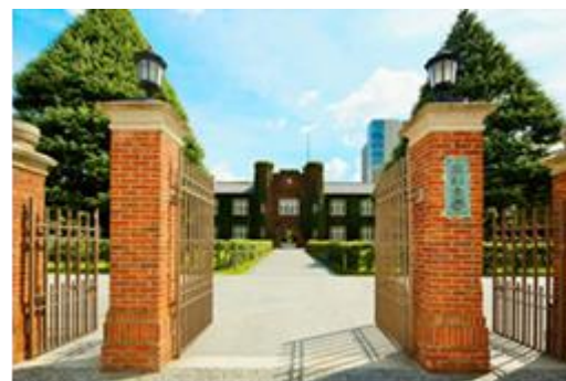
Main gate at Ikebukuro campus

3-34-1 Nishi-Ikebukuro, Toshima-ku, Tokyo 171-8501, Japan