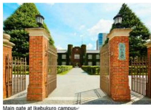
Main gate at Ikebukuro campus

3-34-1 Nishi-Ikebukuro, Toshima-ku, Tokyo 171-8501, Japan