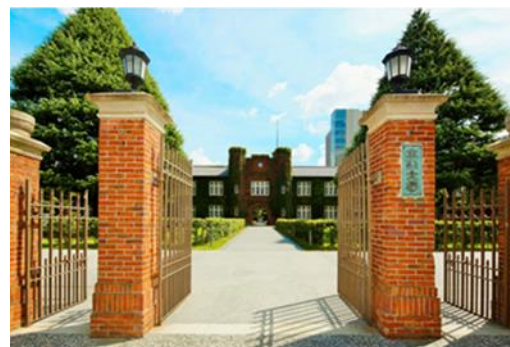
Main gate at Ikebukuro campus

3-34-1 Nishi-Ikebukuro, Toshima-ku, Tokyo 171-8501, Japan