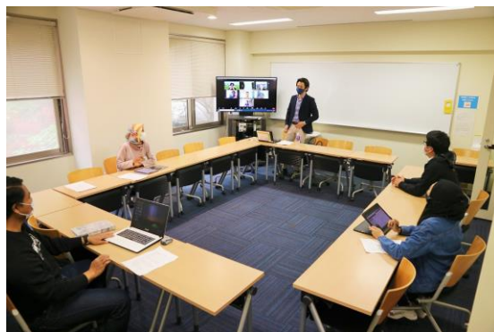
In the classroom

Currently during the ongoing pandemic all courses are held online in order to ensure the safety of students, faculty and staff. This means that all courses are taught in a manner that enables students to participate remotely. Some courses may be instructed using a combination of on-demand, online and face to face group work teaching methods, however, students are assured of the option to participate online in all official course activities for the duration of the semester.