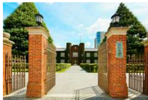
Main gate at Ikebukuro campus

3-34-1 Nishi-Ikebukuro, Toshima-ku, Tokyo 171-8501, Japan