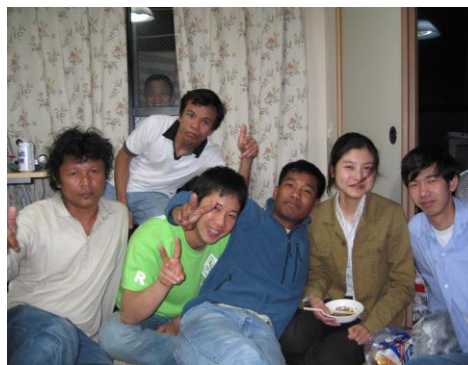
Cambodian students' home party

The current enrollment of the students is 1,642 of which 988 are undergraduate and 654 graduate students (as of October, 2020). More than 250 international students, mostly graduate students, have come to study from various countries. Currently, the total number of the faculty members and staff members is 268 of which the number of full-time academic researchers is 181 including 59 full-professors, 65 associate professors, 57 assistant professors. In