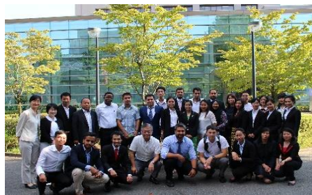
2017 JASID Western Japan Research Meeting, Kumamoto, Kyushu

Since 2017, IGP of Graduate School of Bioresource and Bioenvironmental Sciences, Kyushu University and International Development and Cooperation (IDEC), Hiroshima University with other development programs in western Japan have formed a partnership in hosting annual JASID Western Japan Research Meeting. This provides an opportunity for JICA scholars across disciplines to share ideas and grasp lesson learnt from their peers who are future leaders of their countries. It took place at Kumamoto University, Kyushu on August 29, 2017, held at Hiroshima University in 2018 and Kyushu University hosted the academic meeting in 2019.