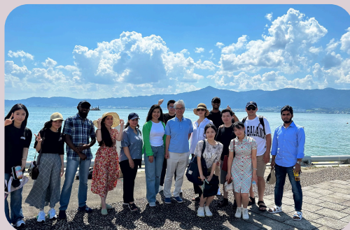
Lake Biwa Museum