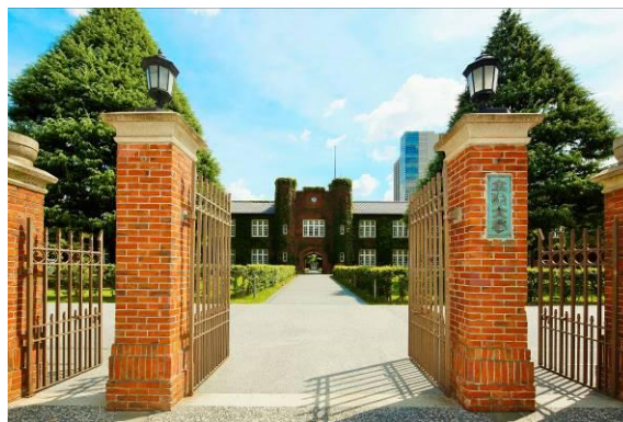
Main Gate at Ikebukuro campus

3-34-1 Nishi-Ikebukuro, Toshima-ku, Tokyo 171-8501, Japan