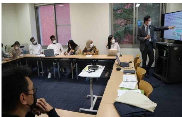
In the classroom

To promote our students to complete master's theses of high quality, we will provide students with opportunities to present their master's theses at international academic conferences, either in the last semester of the second year or after graduation. We also support the publication of the master's thesis if it is of publishable quality.