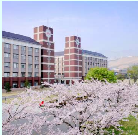
APU CAMPUS BEPPU, JAPAN