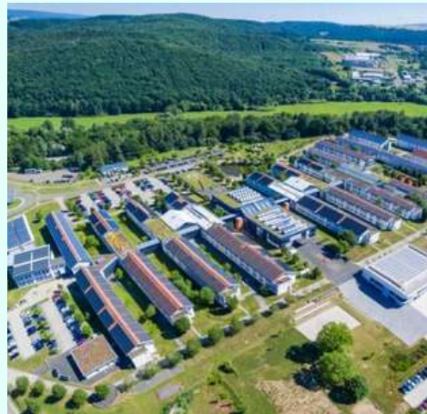
ZERO EMISSION CAMPUS BIRKENFIELD, GERMANY