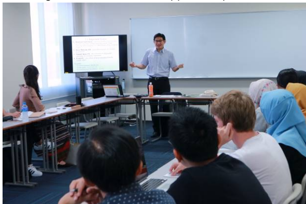
In the classroom

To promote our students to complete master's theses of high quality, we will provide students with opportunities to present their master's theses at international academic conferences, either in the last semester of the second year or after graduation. We also support the publication of the master's thesis if it is of publishable quality.