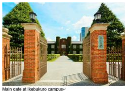
Main gate at Ikebukuro campus

3-34-1 Nishi-Ikebukuro, Toshima-ku, Tokyo 171-8501, Japan