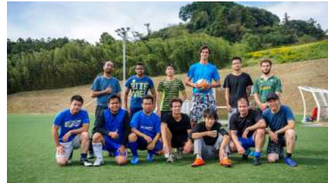
KUFSA Soccer Tournament

In this Program, some scientific tours for the JDS Fellows have been offered from time to time during the two-year Master course period for each fellow. The aims of these tours are to promote a greater understanding of policies, circumstances, and technologies in Japanese agriculture. Our program has proven successful and has been acknowledged by the academic and research institutions of our students' home countries. Research in the individual laboratories in our graduate school, as well as opportunities of exploring fields and of presenting their research at international conferences, enrich their experiences. Our educational excellence is also evidenced by the fact that our graduates are highly sought after by academic institutions and industries alike.