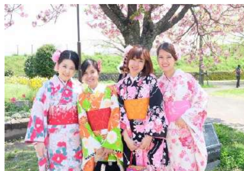
Lao students in Kimono with cherry blossom

The current enrollment of the students is 1,644, of which 963 are undergraduate and 681 graduate students (as of May, 2022). Nearly 250 international students, mostly graduate students, have come to study from various countries. Currently, the total number of faculty members and staff members is 265, of which the number of full-time academic researchers is 173, including 55 full professors, 64 associate professors, and 54 assistant professors. In addition, a number of institutes in Kyushu University, but independent from the Faculty of Agriculture, have also merged with the Graduate School of Bioresource and Bioenvironmental Sciences; namely, the Biotron Institute, the Institute of Tropical Agriculture (in part), and the Bio-Architecture Center.