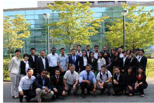
2017 JASID Western Japan Research Meeting, Kumamoto, Kyushu

Since 2017, IGP of Graduate School of Bioresource and Bioenvironmental Sciences, Kyushu University and International Development and Cooperation (IDEC), Hiroshima University with other development programs in western Japan have formed a partnership in hosting annual JASID Western Japan Research Meeting. This provides an opportunity for JICA scholars across disciplines to share ideas and grasp lesson learnt from their peers who are future leaders of their countries. It took place at Kumamoto University, Kyushu on August 29, 2017, held at Hiroshima University in 2018 and Kyushu University hosted the academic meeting in 2019.