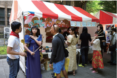
May Festival at Hongo Campus