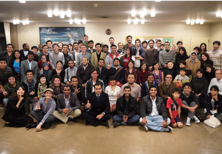
Welcome Party organized by ISACE (The International Students' Association in Civil Engineering)