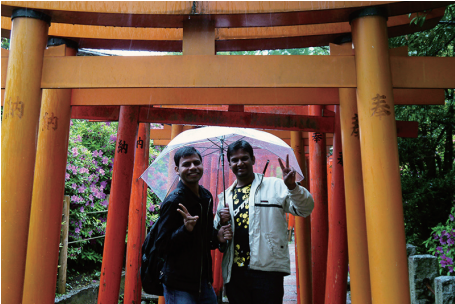
JLC - Excursion to Nezu Shrine