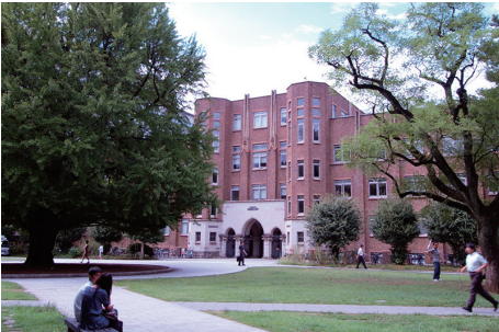
Civil Engineering Building