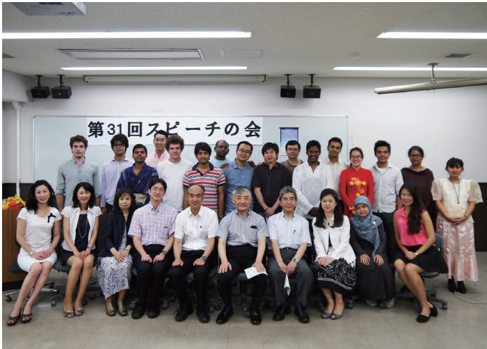
JLC - Speech Contest