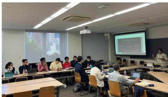
In the classroom

In their first year, students take at least five Elective 1 courses related to social design, acquiring foundational knowledge and a capacity for logical thinking. In the second year, they take Elective 2 courses in line with their research interests and complete a Master's thesis. Through this combination of coursework and thesis writing process, students can acquire expertise in public policy and social design.