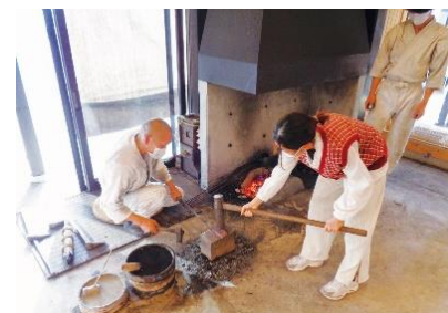
Students enjoying making Cutlery

Exchange Cooperative Program offered by the University's Center for Regional Exchange and the Inuyama Studies Research Center at our University.