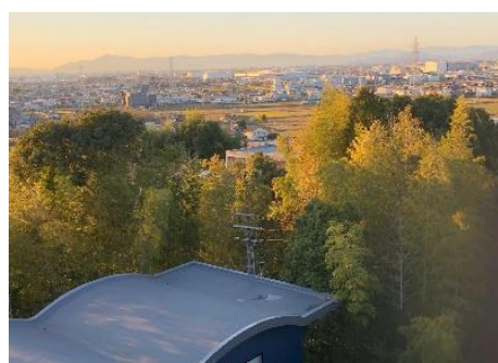
View from the fifth floor of NUE Main Building

The University's Center for International Affairs (CIA) provides extensive and detailed support for international students in