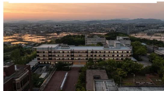
NUE in the evening twilight

The location of NUE, in the suburbs of Nagoya City, the heart of Japan, attracts students because of its rich nature and local areas renowned for traditional manufacturing. NUE has another educational pillar, "to grow together with the local people." The university specializes in four faculties (Department of Law, Economics, Business, and Human Life and Sciences) and three graduate schools (Graduate School