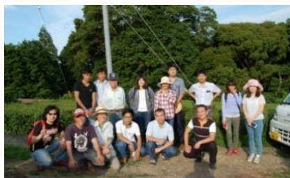
Visit to an organic tea farm in Fujieda, Shizuoka