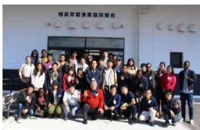
Field Trip to Fukushima

Since IIAS was established as Department of International Environmental and Agricultural Science (IEAS) in 1999, we have hosted many international students from Japan, South Korea, China, Vietnam, Cambodia, Laos, Thailand, Myanmar, Malaysia, Indonesia, Mongolia, India, Bangladesh, Nepal, Uzbekistan, Afghanistan, Iran, Kenya, Ghana, Brazil, etc. Our university has strong international network of sister universities. IEAS and IIAS alumni and students include 38 JDS fellows from Vietnam among 117 JDS fellows from Asian countries. They have been playing active roles related with agriculture and environmental fields. We train students to serve as leaders with “field-oriented” mind and skill sets so that they can identify environmental issues and propose effective measures for achieving sustainable development while cooperating with local and global stakeholders in the world.